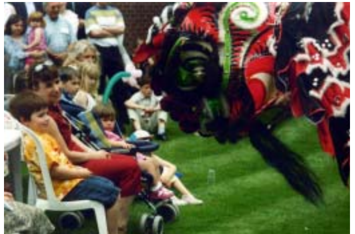
Chinese Lion Dance